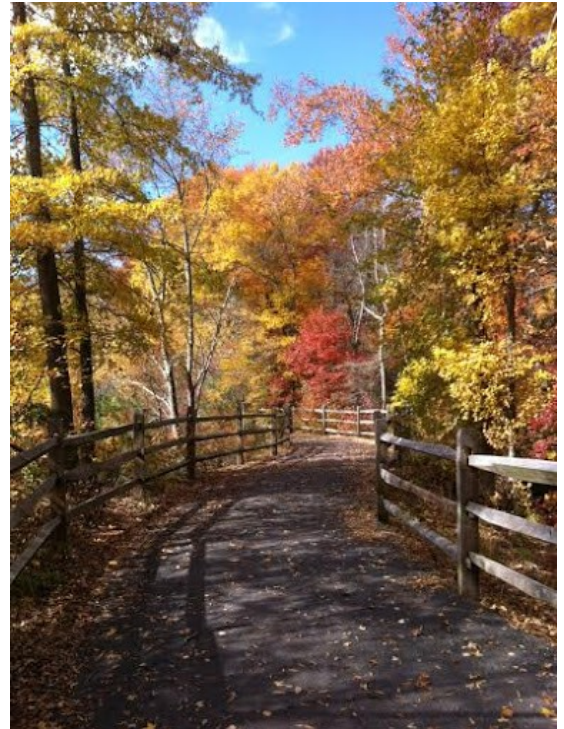
3rd place— Beautiful Fall Day by Eric Houser