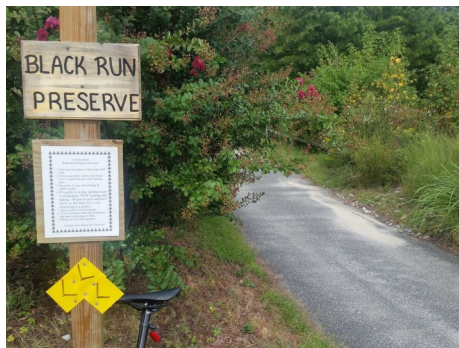
The Links Golf Club www.thelinksgc.com

FBRP is partnering with King’s Grant Links Golf Club owner, David Quinn. Black Run Preserve visitors may now use the Link’s parking lot to access the Preserve, simply follow the signs from Club’s parking lot and the yellow blazes with an “L.” This trail leads to the Blue Trail and also connects with the newer section of the White Trail. Visitors are welcome to obtain a free of charge Links “social membership” to obtain food and beverage. Visit www.thelinksgc.com to learn more about The Links Golf Club.